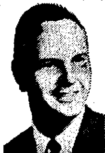
Samuel G. Kurtz, Inc.